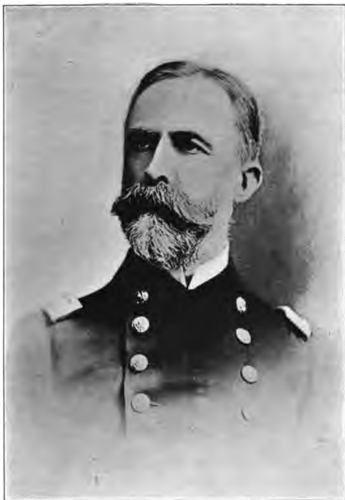
REAR ADMIRAL WILLIAM T. SAMPSON